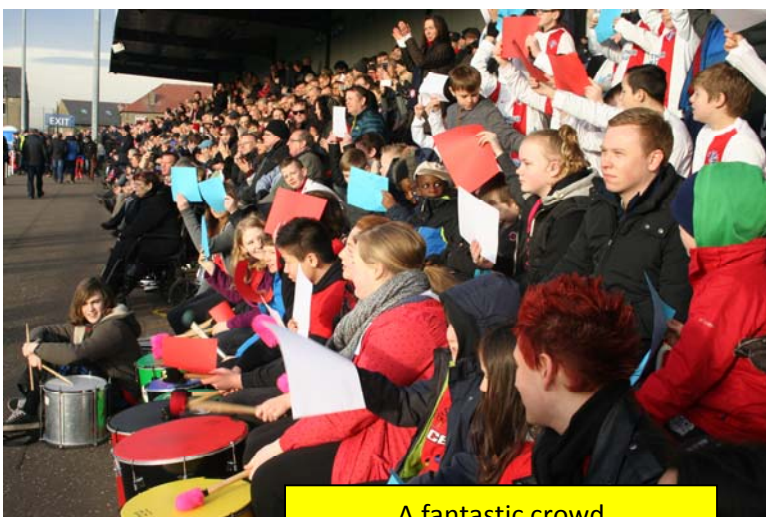
A fantastic crowd