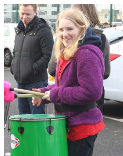
Not cold... not cold... not cold

Our teaming up on that day was a part of that Olympic Legacy and maybe opened doors for a future partnership working.